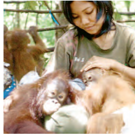
► These little ones are traumatised from the loss of their mothers and need around-the-clock care

Kumie took a job caring for orphaned baby orangutans with some trepidation but she says, 'It turns out they are really cute and they behave just like human babies'.