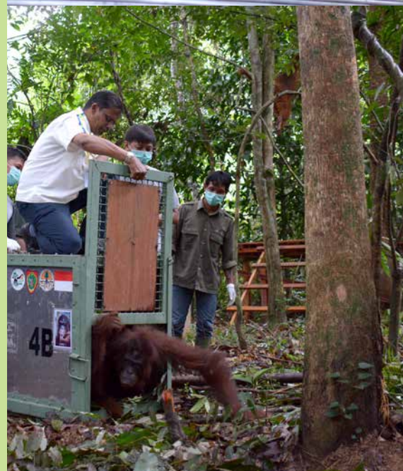
Right top: Lido at Nyaru Menteng